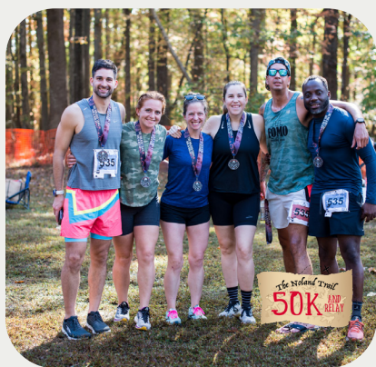
First Wave of Runners Begins at 7:00 AM