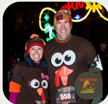
5K Begins at 6:30 PM

Before the turkey and the stuffing, take part in the most LIT holiday run of the season! The Glowing Gobbler 5K is an evening race that gives runners a unique opportunity to run through Newport News Park's Celebration In Lights . Get in the holiday spirit have a little run while you're at it!