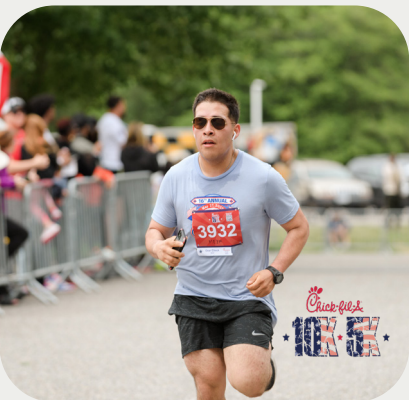
10K begins at 8:30 AM 5K begins at 8:45 AM Mariners' Museum & Park

17th Annual Chick-fil-A 10K/5K Featuring the Running of the Cows Fun Run May 25, 2024