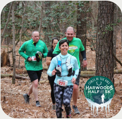
Half Marathon begins at 8:30 AM 5K begins at 9:15 AM Harwoods Mill Park