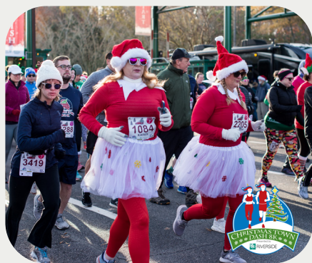
8K Begins at 8:30 AM