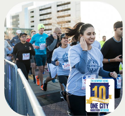
5K & Nautical Mile - March 2 Marathon & Half Marathon - March 3 Newport News

The Newport News One City Marathon, celebrating its 10th year, is a popular point-to-point marathon in Virginia's Hampton Roads area. The course is renowned for its fast times and its high percentage of Boston Qualifying runners. This event offers Half Marathon, 5K, and Nautical Mile Fun Run options.